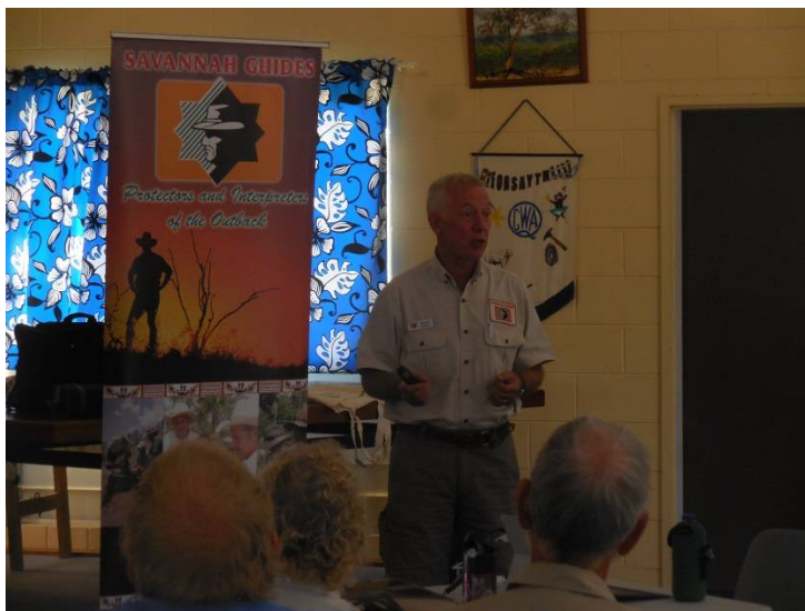
Savannah Guides Workshop, April 2017

With key staging posts at both the Undara and Cobbold resorts, and solid representation through the Mt Surprise-based Bedrock Village tours to Undara, the strong presence of this network is a key strategic asset from a human resource viewpoint – so important for high levels of quality assurance in interpretation and storytelling.