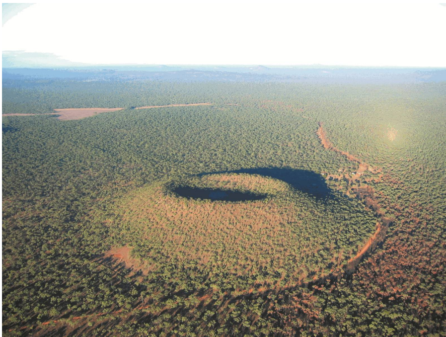
Kalkani Cone, Undara, photo courtesy of Savannah Guides Network

And travelling en route from Cairns, a stop over to visit the very picturesque peaks, lakes and waterfalls of the Atherton Tableland.