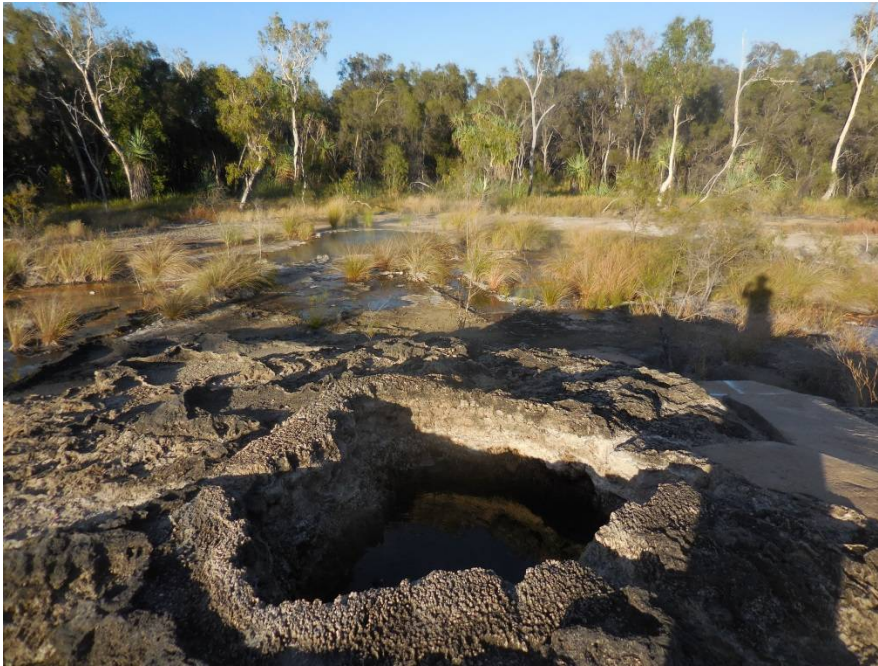
Talaroo Hot Springs

The abovementioned visit to China undertaken in September 2017 has resulted in a proposal, discussed with senior Guizhou Province Government officials, predicated on the following assumptions and approach designed to attract a geotourism-primed Chinese market to consider travel to Far North Queensland Region (including Etheridge Shire).